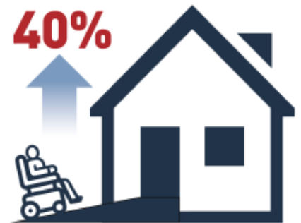
Increase in materials and labor costs for home modifications since 2010.