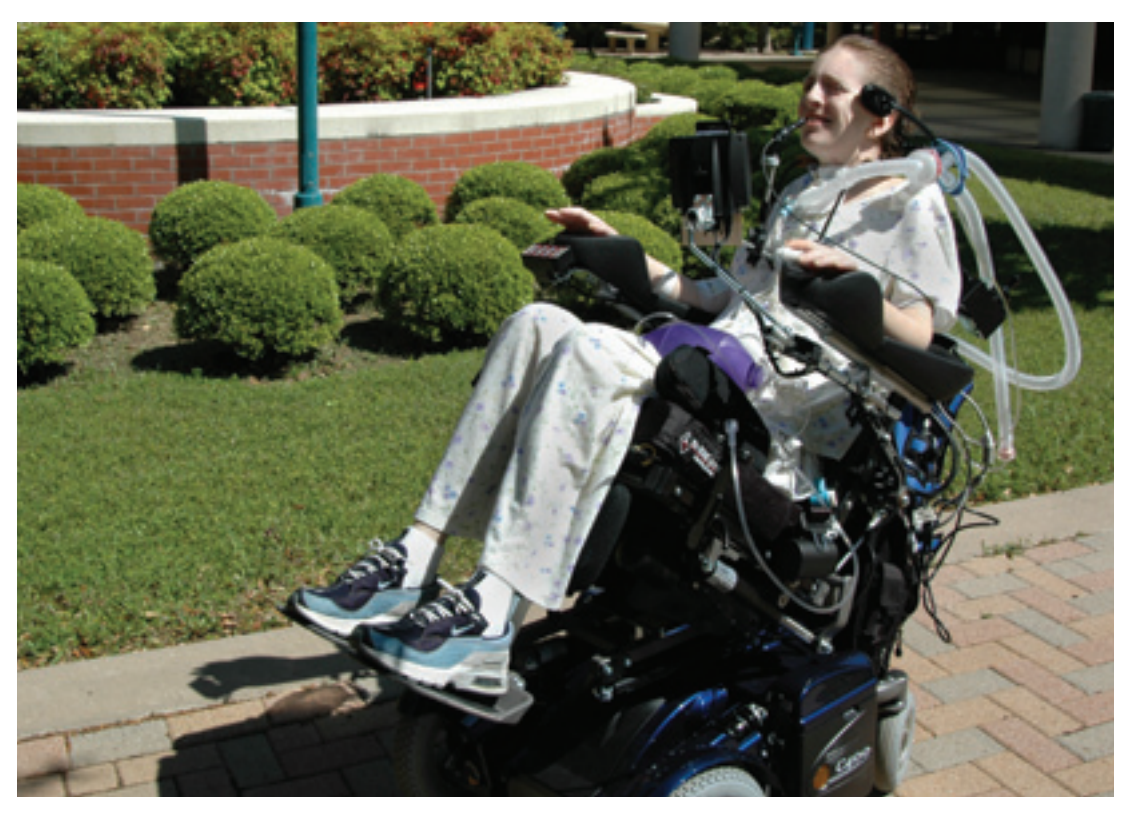
Traveling Outside with Equipment