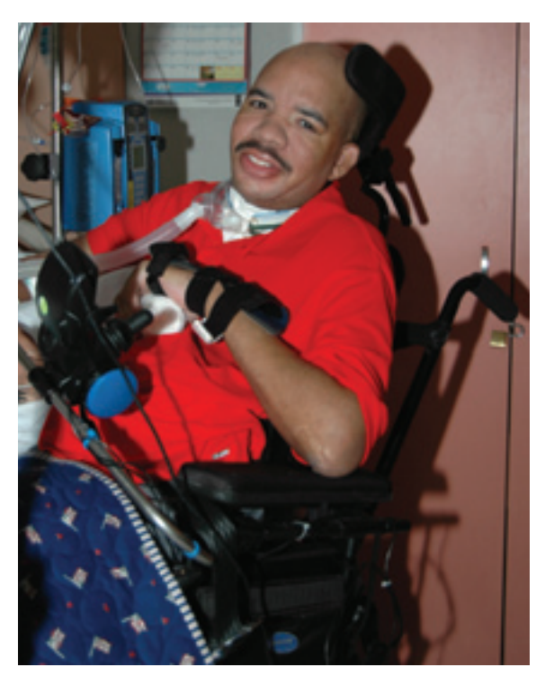
Breathing Using a Trach Tube

Some people can breathe well enough to use a mask instead of having to have a tracheostomy. In this case, the ventilator is adjusted so that it provides just enough pressure to allow the person to breathe in and out comfortably. The pressure to inhale can be set differently than the pressure to exhale depending on a person's needs.